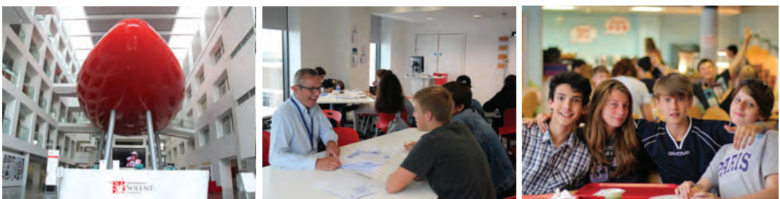
Above: Before the Boat Party! Left to right: Southampton Solent University, classroom, dining hall.

*The age range is 11-17. However, we may accept a younger or older student from the same school year as someone else in the group.