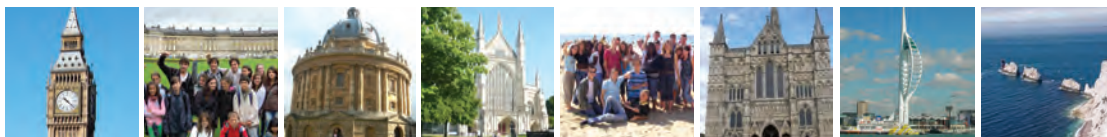
Trip destinations (left to right): London, Bath, Oxford, Winchester, Bournemouth, Salisbury, Portsmouth, Isle of Wight