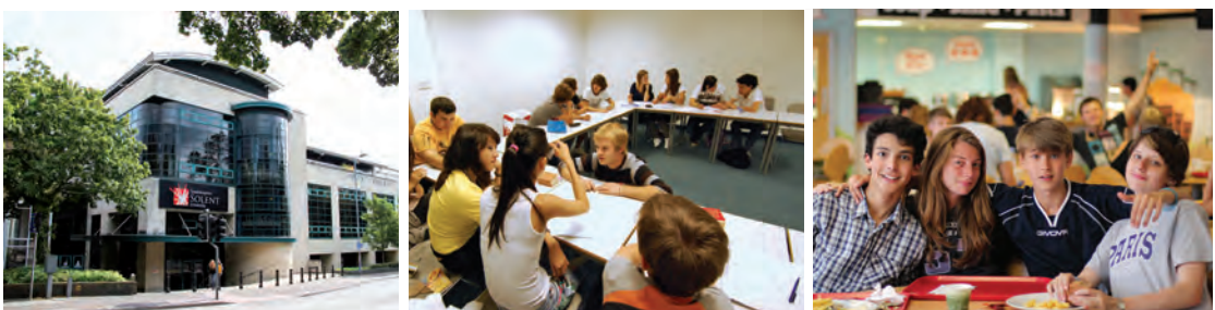
Above: Before the Boat Party! Left to right: Southampton Solent University, classroom, dining hall.

*The age range is 11-17. However, we may accept a younger or older student from the same school year as someone else in the group.