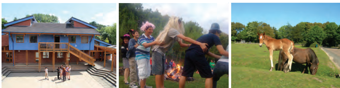
Above: Our students. Left to right: Ringwood Waldorf School, around the campfire, New Forest ponies.

*The age range is 11-17. However, we may accept a younger or older student from the same school year as someone else in the group.