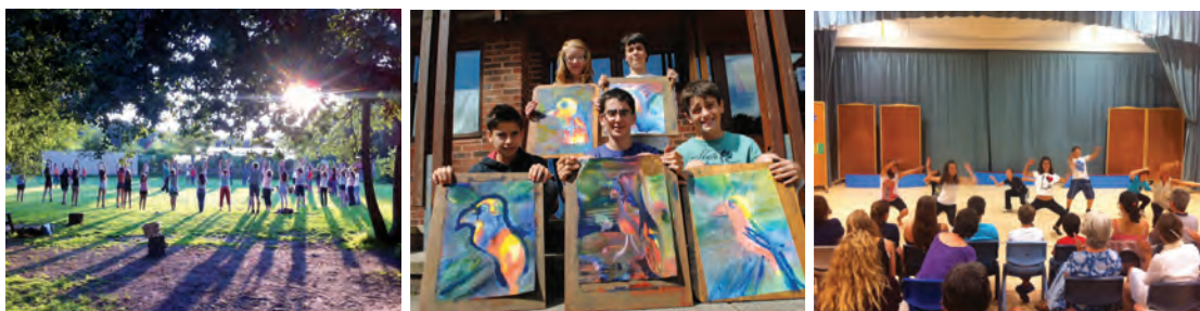
Left to right: capoeira, art activity, talent show.