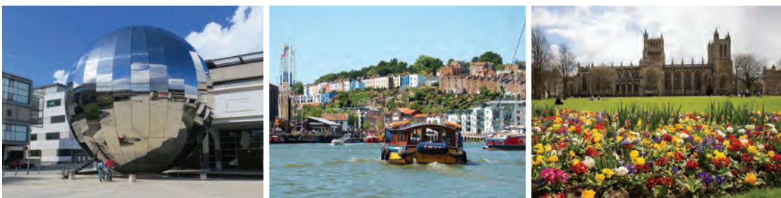
Above: Clifton Suspension Bridge. Left to right: Planetarium, waterfront, Bristol Cathedral.

*The age range is 11-17. However, we may accept a younger or older student from the same school year as someone else in the group.