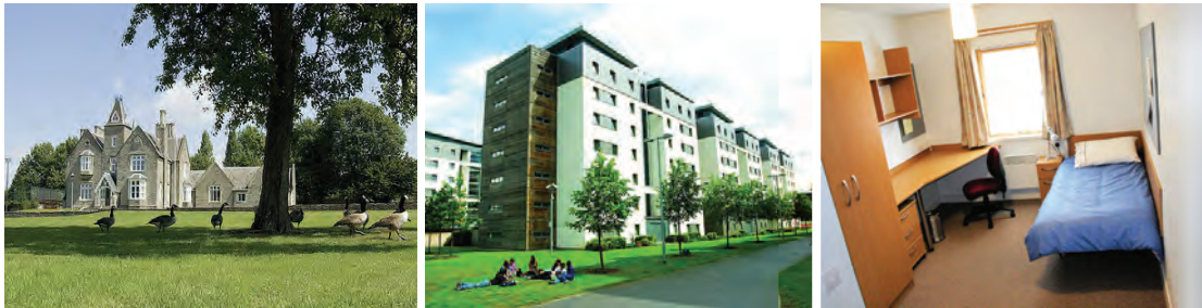
Left to right: The Farm House, exterior view of residence, bedroom in residence