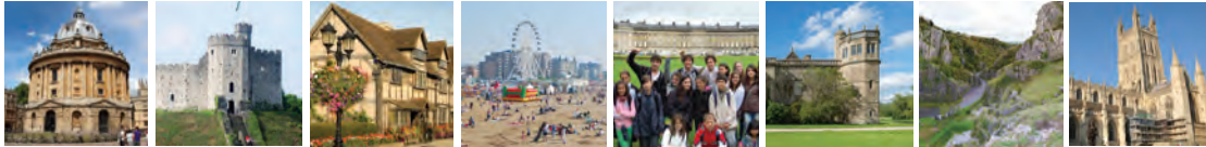
Trip destinations: Oxford, Cardiff, Stratford-upon-Avon, Weston-super-Mare, Bath, Lacock Abbey, Cheddar Gorge, Gloucester.