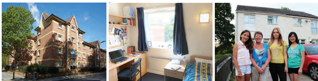
Left to right: Residential accommodation, bedroom in residence, homestay accommodation.