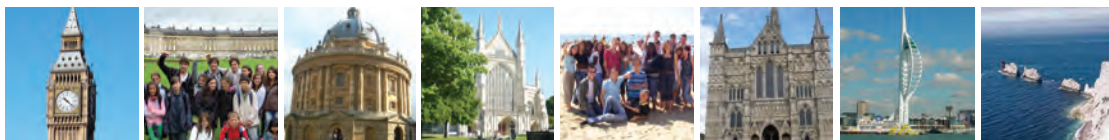
Trip destinations (left to right): London, Bath, Oxford, Winchester, Bournemouth, Salisbury, Portsmouth, Isle of Wight