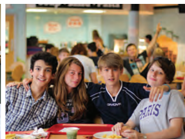
Above: Before the Boat Party! Left to right: Southampton Solent University, classroom, dining hall.